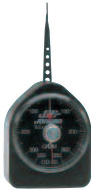
Small Gauges (Flat Tip, Dial Diameter 1 1/2")

Measurement is extremely simple. Just place point of gauge arm perpendicular to the force to be measured. Reading can be taken in both directions - clockwise and counter-clockwise. Gauges offer extreme precision and durability. The measuring springs are made of hard tempered annealed beryllium copper. All gauges equipped with maximum reading pointer. Tolerance \pm .01 (Reading + Maximum Scale Reading.)