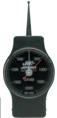
Large Gauges (Round Tip, Dial Diameter 2 1/2")